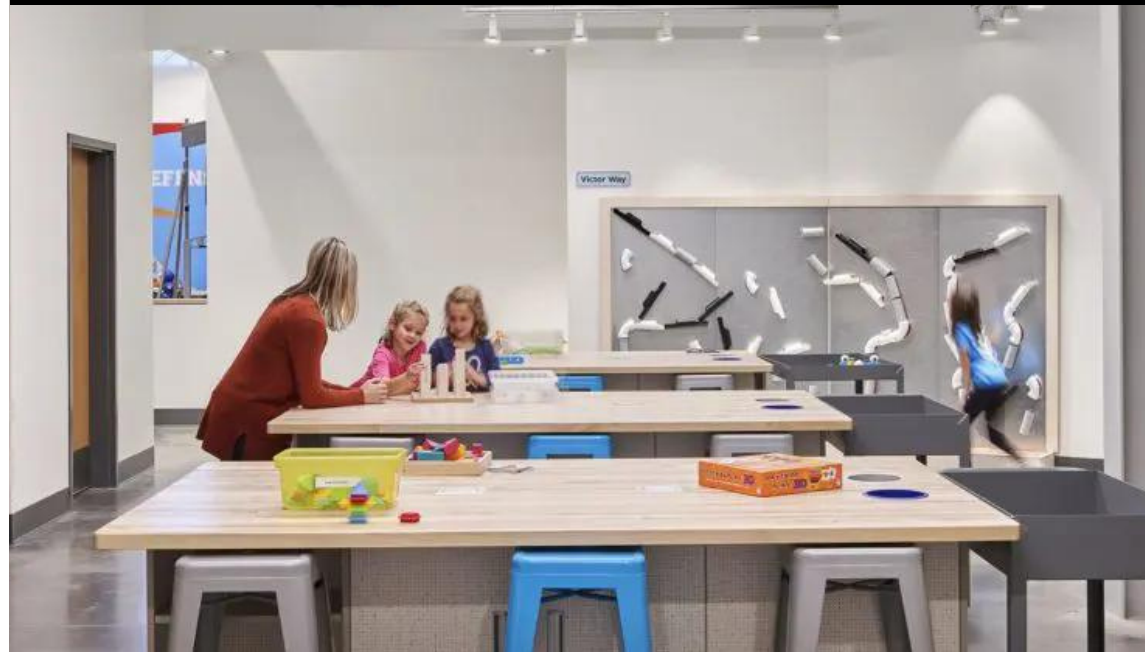
Creation Station: Design Lab & Art Studio